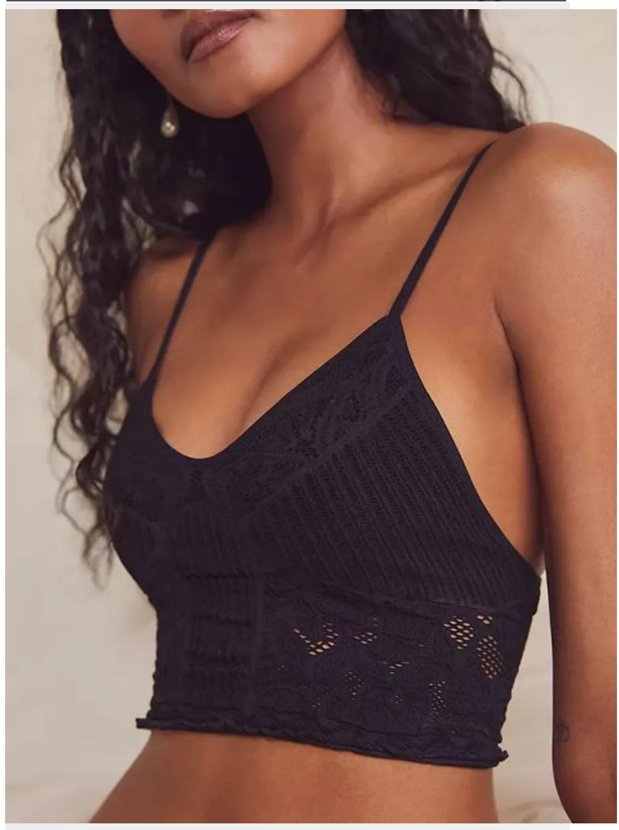
Seamless Exquisite Mesh Top Product Introduction